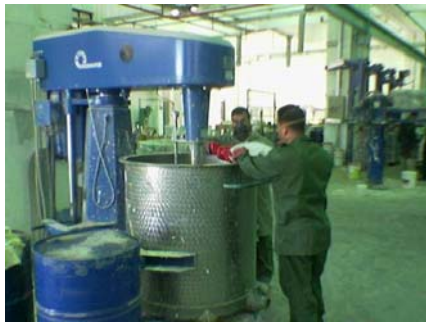
Mixing of raw materials