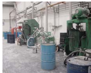
Paint production process